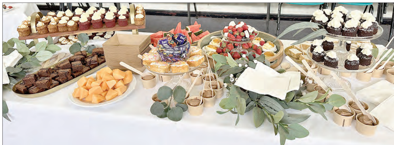
• The delicious dessert buffet was a feast for the eyes as well as the stomach.