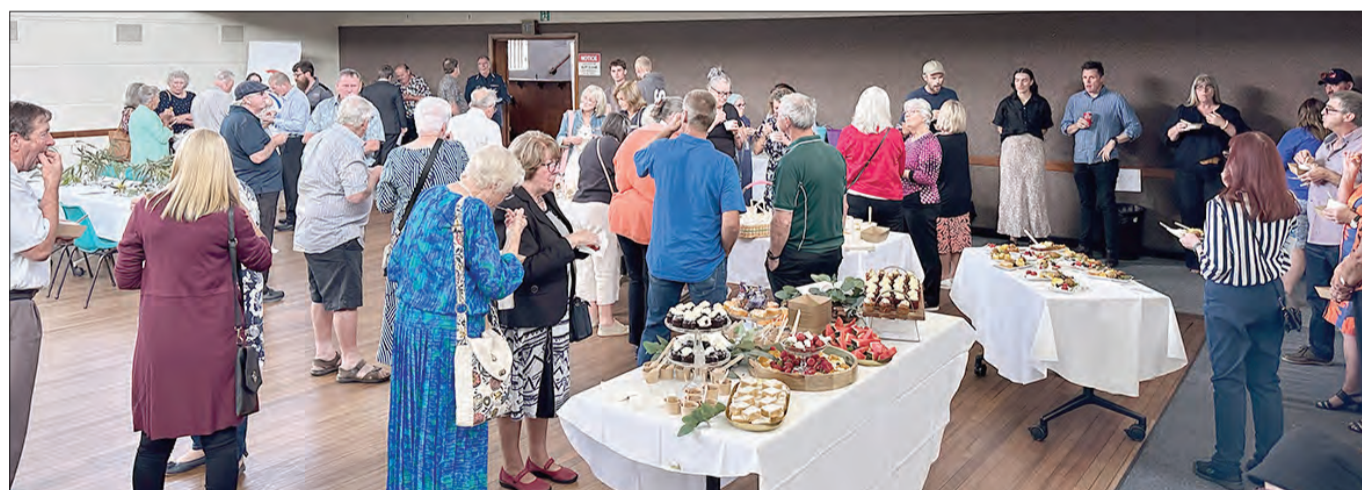
• Guests gathered to enjoy a light buffet meal.