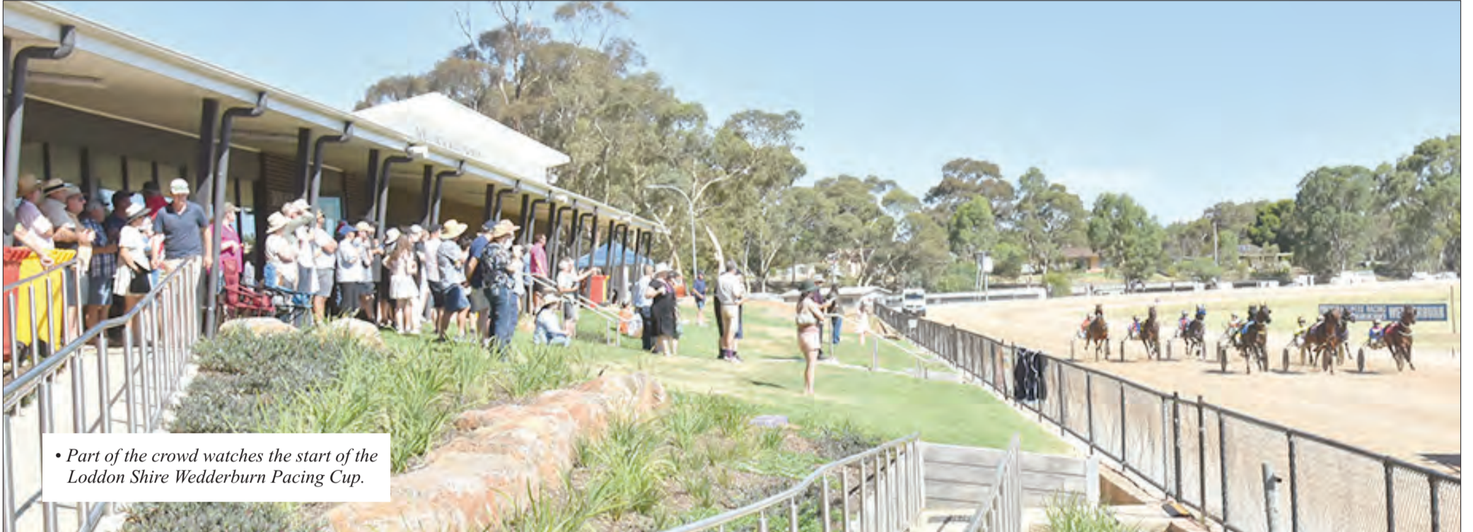
• Part of the crowd watches the start of the Loddon Shire Wedderburn Pacing Cup.