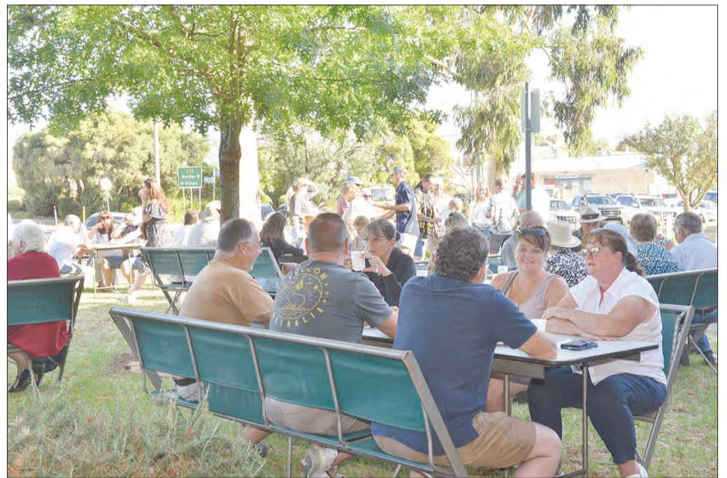
• A large crowd attended the Charlton ceremony, enjoying the pleasant outdoor setting for the traditional breakfast.