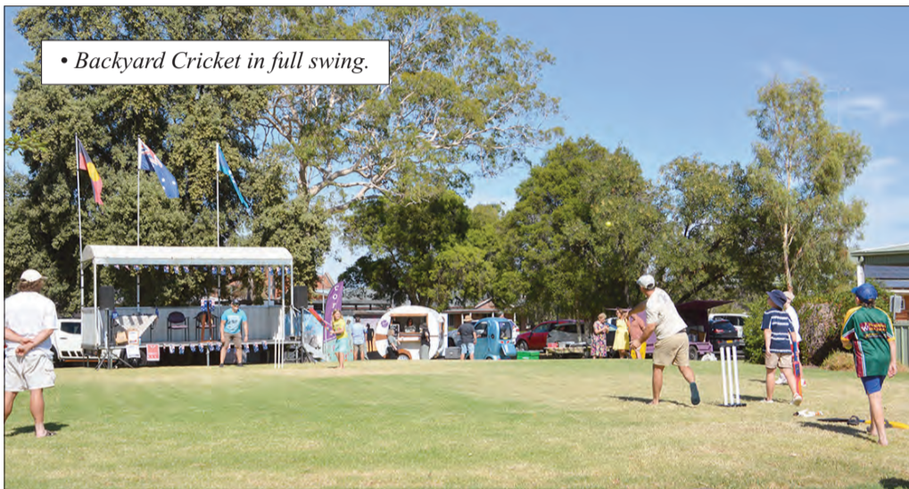
• Backyard Cricket in full swing.