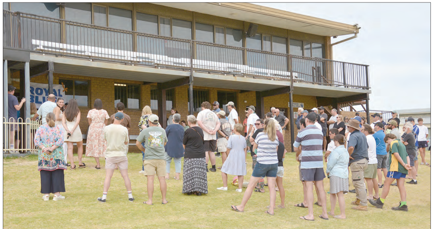
• A good crowd stuck around despite the long weekend.