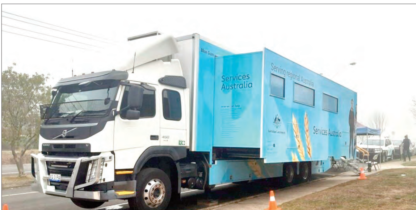
• Blue Gum coming to a town near you!