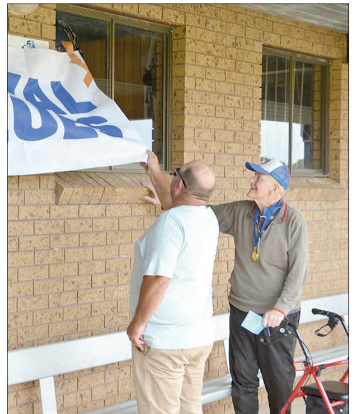
• The too effective trainers tape nearly upstaged the unveiling.